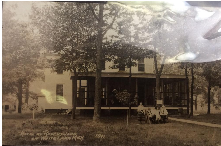
Hotel Ravenswood on White Lake

History indicates that many of these early hotels had no electricity, indoor plumbing or telephones. (And certainly no cell phones or Wi-Fi.) Rooms were often small & toilets and washbasins, if present, were located in hallways. The former Cook residence was added to as needed, sometimes very haphazardly, eventually providing 16-18 rather undersized guest rooms.