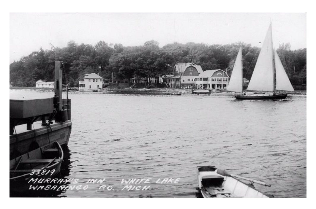
1928-41ca- Murray's Inn from Lau Road