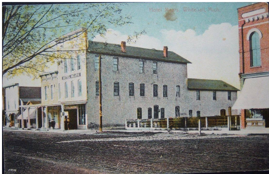
Hotel Mears – 1905ca