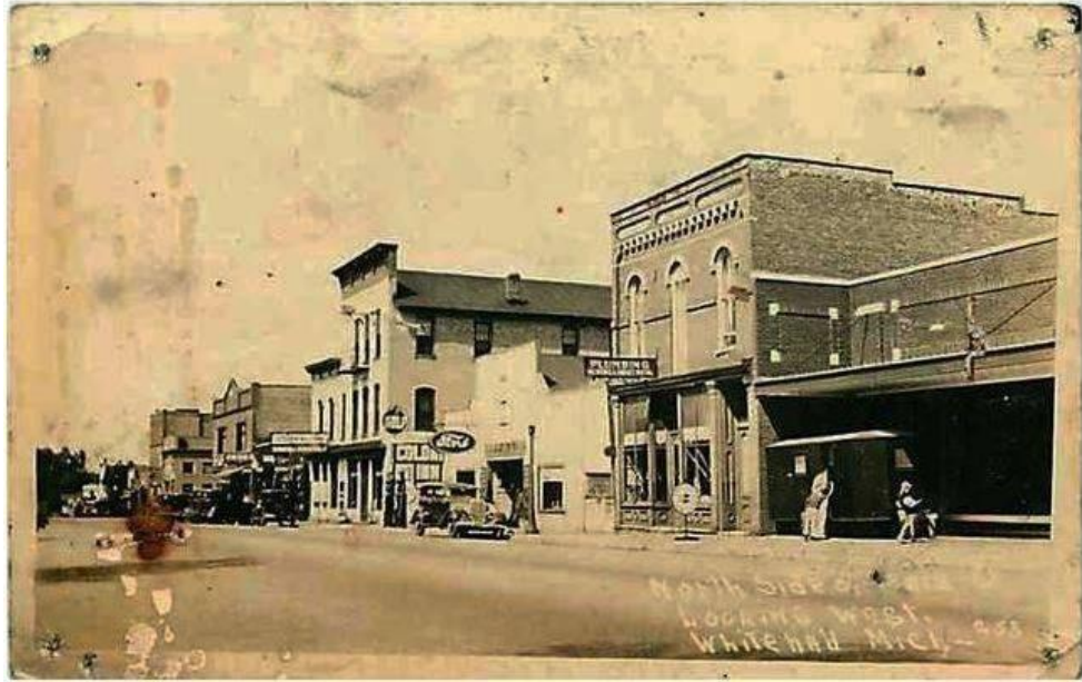
1930ca – Colonial Inn (The tall white building in the center of the picture with Colonial Inn on the side.)